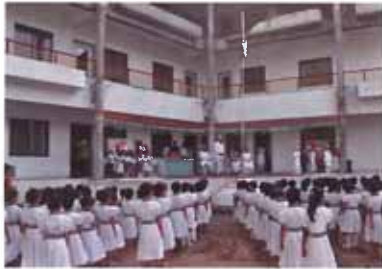
Anubhuti-2 : Totally free school for childrens of BPL families