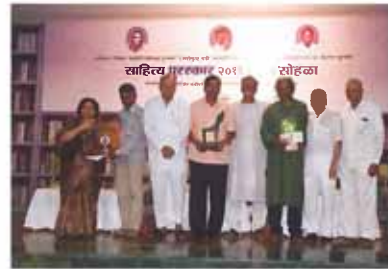
Bahinabai Literary Awards given to outstanding Marathi writers