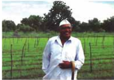
Happy farmer is at the core of all our activities.