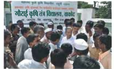
Inaugurating agriculture school at Wakod, India