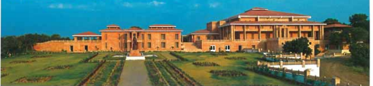
Gandhi Teerth at Jain Hills, Jalgaon.

Mission : Strive to help establish a world founded on Truth, Ahimsa, Peaceful Co-existence, Conservation and Love for labour-values cherished and practised by Gandhiji. Vision : Preserve for posterity the precious legacy of Gandhiji's life, thought and work.