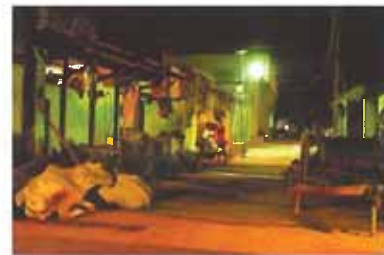
Jain Solar Street Lighting at Wakod

In Jain Sports Academy along with Fitness Program, Mental Programs, Technical Program, Diet Program, Tournaments, Match Practice, Coaching Camps and Seminars, hard work emphasized and Humility is practised.