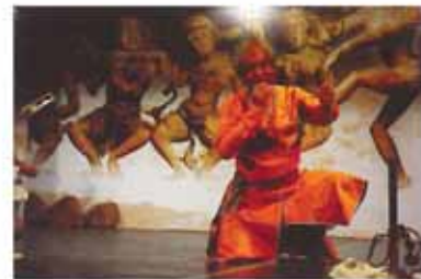
Internationally acclaimed Kathak exponent Birju Maharaj at a performance in Jalgaon