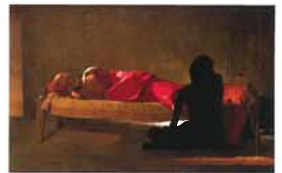
Museum : Gandhi at Champaran, commiserating with a farmer