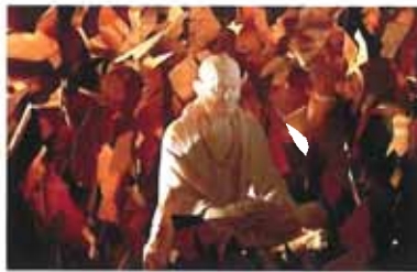
Museum : Installation showing Gandhi at peace amidst violence