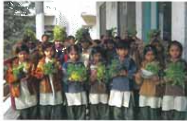
Children of Anubhūti School-2 with the 'methi' plants that they grew in their school project

The Anubhūti-1 residential school, located at our Divine Park campus is developed for preserving Indian heritage and culture in young minds, while preparing them for global competitiveness and competence. The Anubhūti-2 day school located in the centre of Jalgaon town provides free education, food and uniforms to the children of the most deprived below-the-poverty-line families. In addition, two rural schools and an agricultural college are established at the village of Wakod. Under the aegis of Bhausaheb Sundarlal Mahara Potential Development Academy, we undertake many activities for the development of student's ability and aptitude to take on the challenges in the new world.